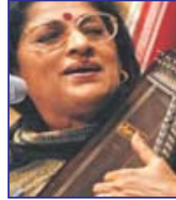
Kishori Amonkar [ 1 ]