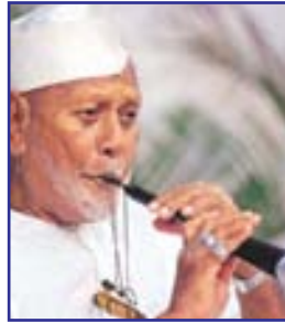
Bismillah Khan [ ]