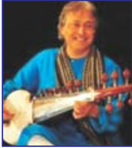
Amjad Ali Khan [ ]

1. Match the musicians with the musical skill they are known for. One is done for you.