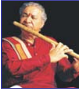
Hari Prasad Chaurasia [ ]