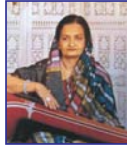
Begam Akhtar [ ]